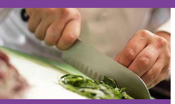
Culinary Classes begin in February!