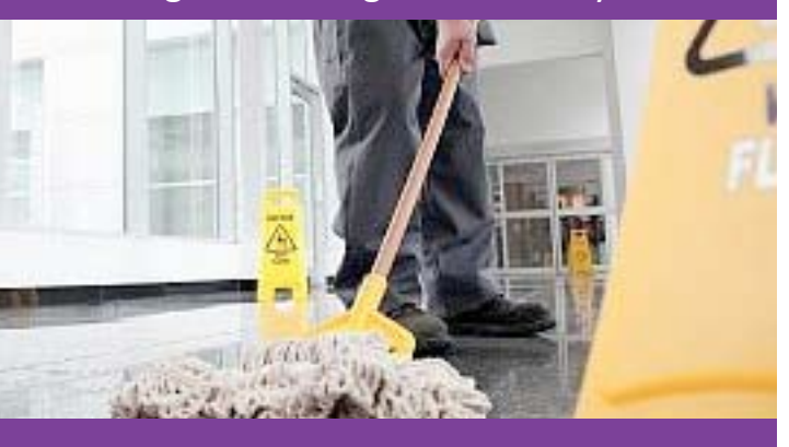
Custodial Training Classes begin in April!