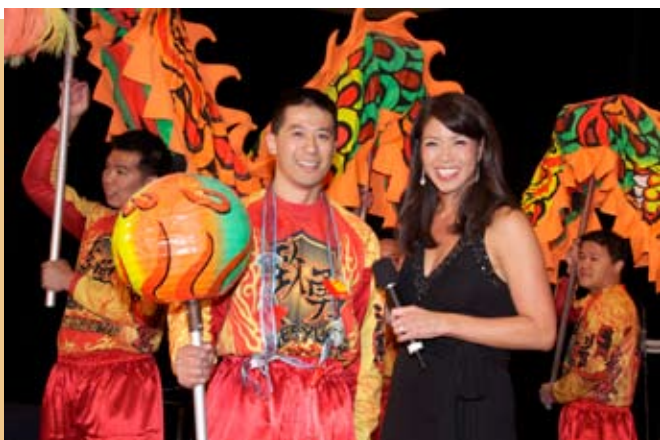
Lion Dance by Gee Yung International Martial Arts Dragon & Lion Dance Association