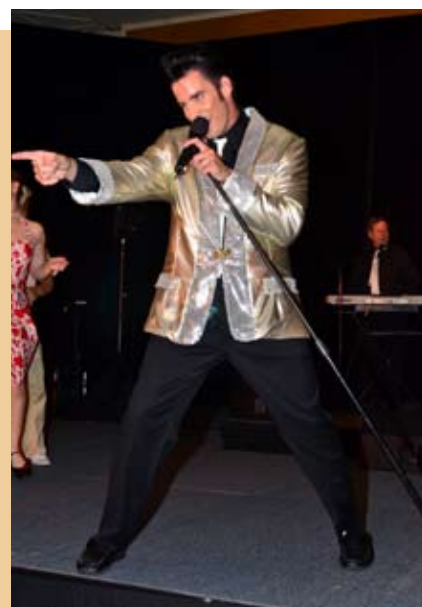
Performance by the band, Doubletake