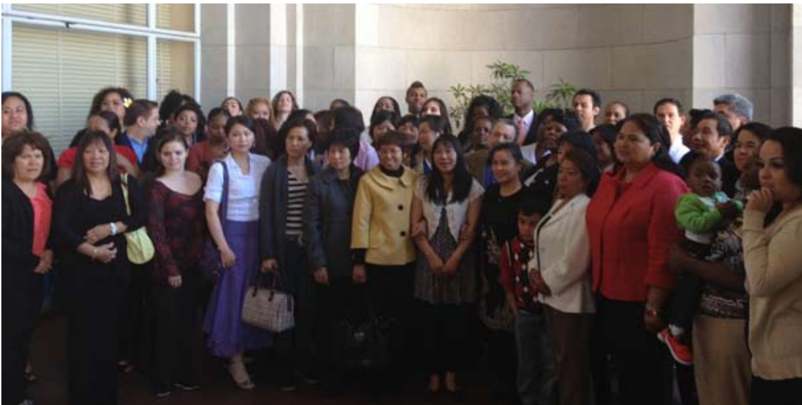
City-wide Health-care Academy Graduation ceremony at War Memorial Building.

職業訓練和經濟發展部於二零一一年度的大多數的培訓班都已結束或將近完成課程，並將在秋季舉辦二零一二年度開辦更多培訓班。我們正在為清潔班、護理班、A + 認證的電腦技術員和旅遊及餐飲服務的相關課程公開招生。我們預計在二零一二年年底前招募和培訓一共九十名參加者。