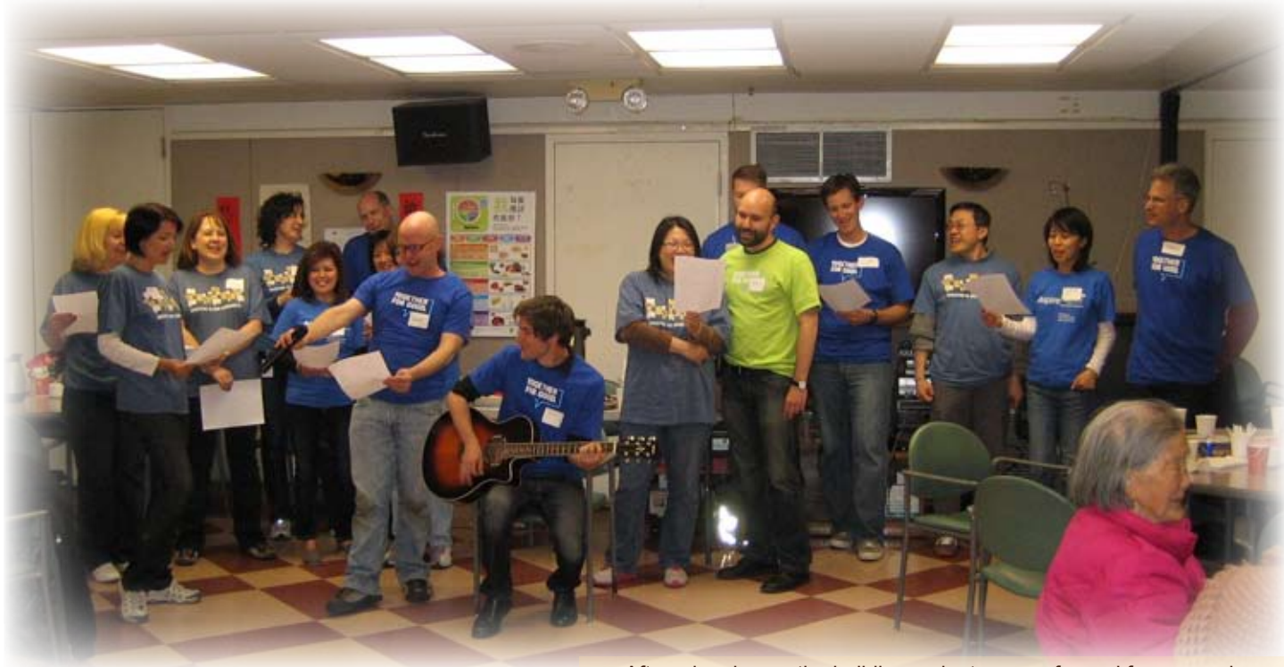
After cleaning up the building, volunteers performed for our seniors. 完成清潔工作後，Charles Schwab義工為耆英們演唱。