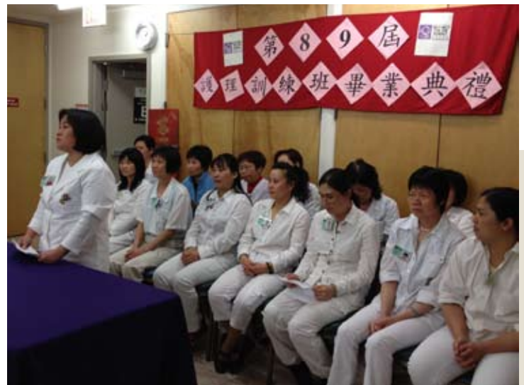
Class representative spoke at the HHA graduation ceremony 畢業生代表致謝辭

Most of our training classes were completed of the year 2011 or are working towards completion in 2012. ETED will host more training classes from fall 2012. We have opened enrollments for the Housekeeping, Home Health Aide, A+ Certified Computer Technician and Hospitality Job Readiness Trainings. We expect to recruit and train a total of 90 participants by the end of the year.