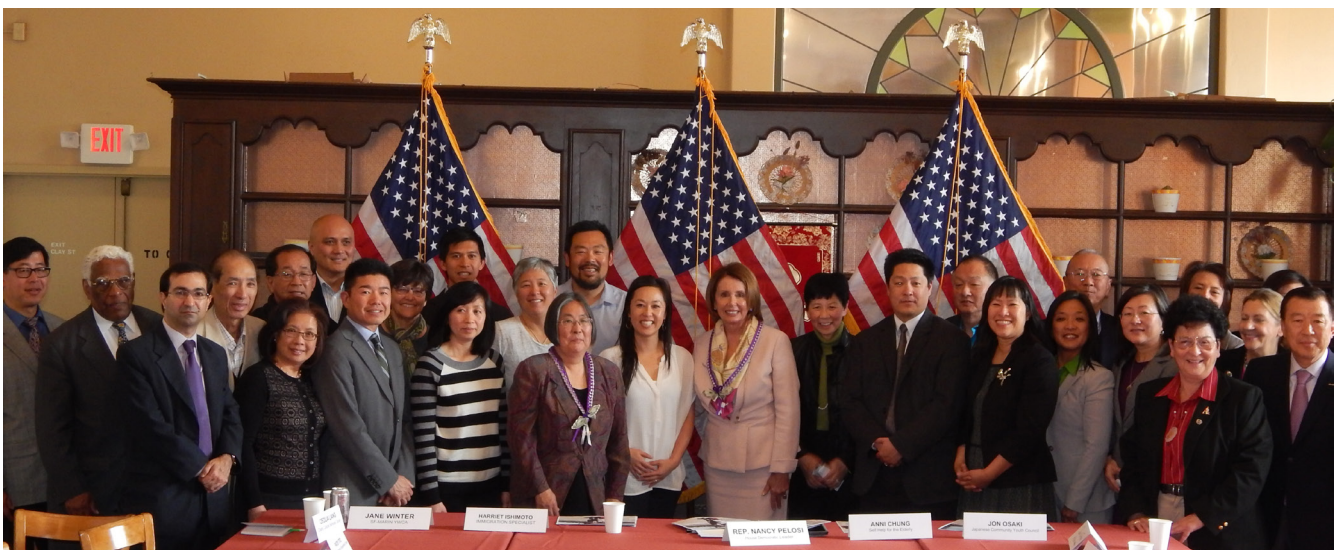
Group photo with Congresswoman Nancy Pelosi at the San Francisco YWCA

普洛西向社區人士擔保她以及國會民主黨人將會繼續努力解決這些問題，透過推動大膽的舉措來修補已經漏洞百出的移民系統，透過增加最低工資來提供薪水較高的工作，以及讓更多人有機會接受高等教育。