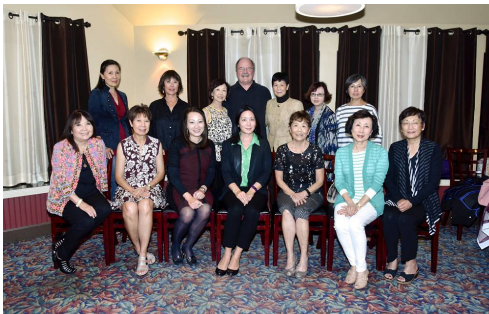
The Board of Directors for the Longevity Gala 2015