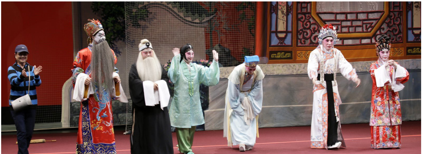
Performers on stage

來賓度過了一個趣味的下午，欣賞到有規模的演出包括歌唱、舞蹈及工架表演。這次活動非常成功，在場人士都贊同是一好享受！