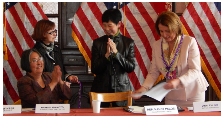
Self Help for the Elderly staff and Congresswoman Nancy Pelosi

The congresswoman reassured the community that she and House Democrats will continue their efforts to address these issues by pushing for bold action to fix the broken immigration system, provide good paying jobs by increasing the minimum wage and increasing access to higher education for more people.