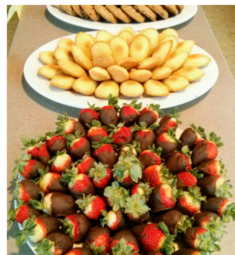
Dessert Table featuring honey madelines and chocolate-covered strawberries.