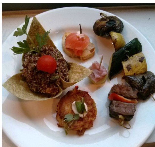
Tasting Menu: Quinoa Salad, Salmon Bruschetta, Crab Cake, Skewed Grilled Vegetables, Charbroiled Sirloin Steak Cubes.