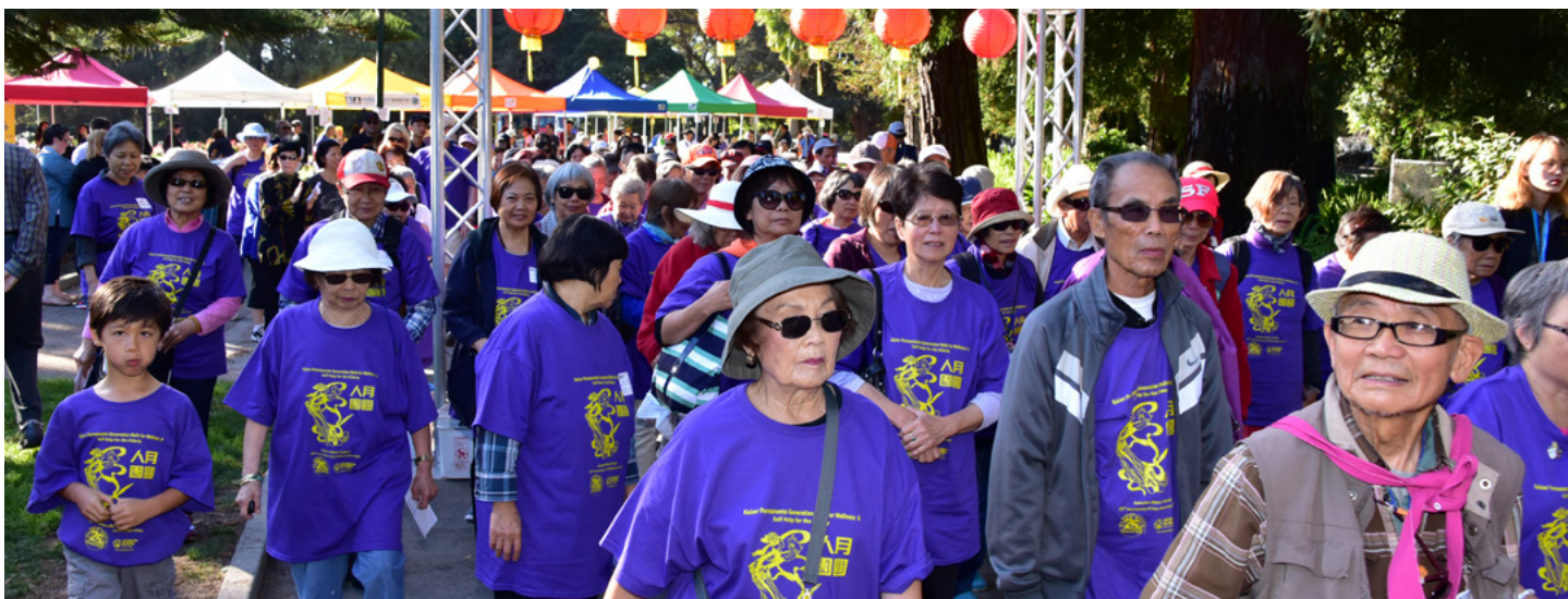
Happy Autumn Moon Festival! Over 150 families gathered to participate in Generational Walk for Wellness.