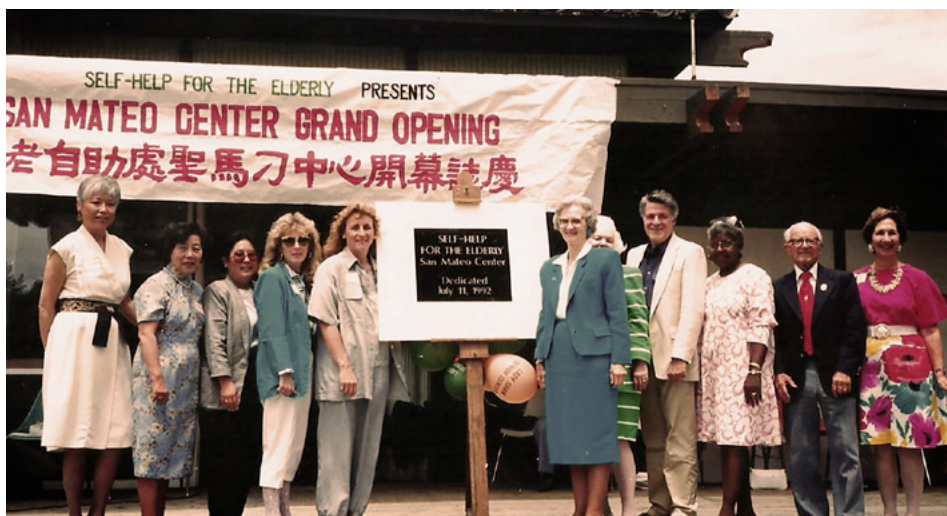
On July 11, 1992, Self-Help for the Elderly San Mateo Center opened its doors and embarked on its continuing mission to enhance the lives of local seniors.