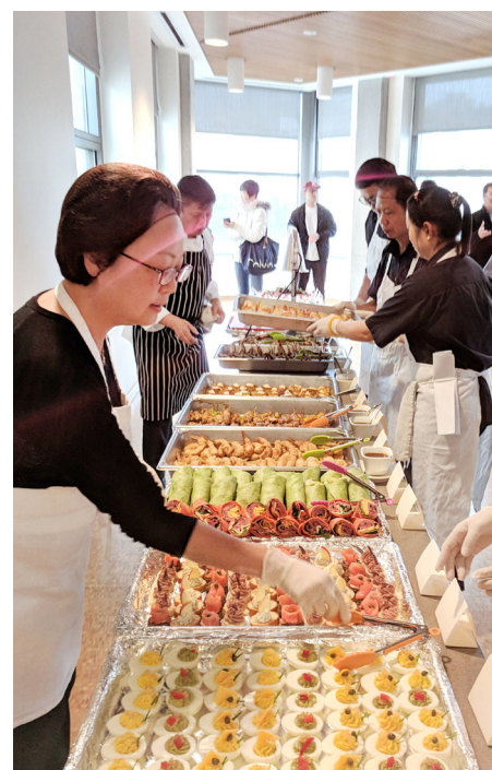
2018 Food Prep and Production Training Graduates preparing food for events guests.