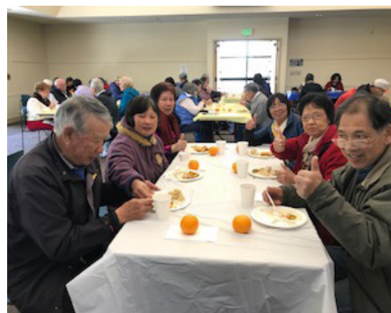
65 seniors enjoyed a hot delicious meal, baked fish with olive, broccoli and cauliflower, on March 5, 2018.