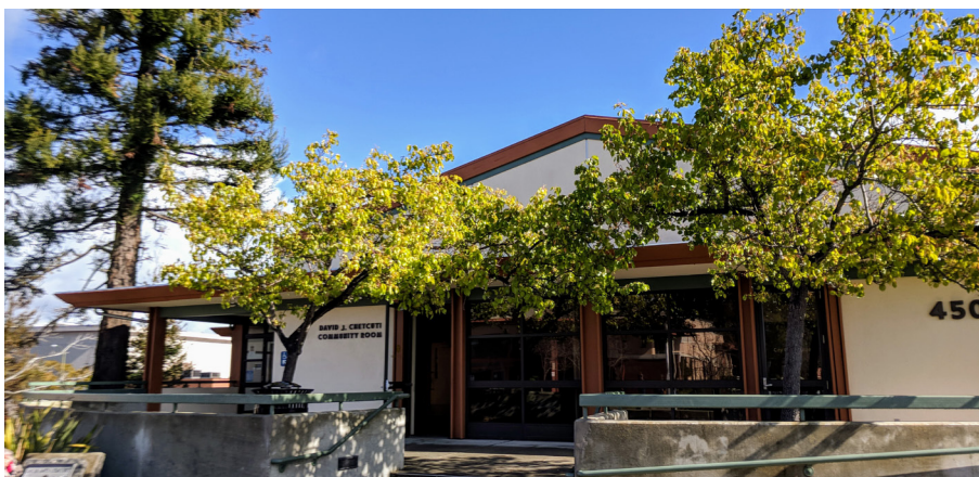
450 Poplar Avenue, Millbrae, CA 94030.