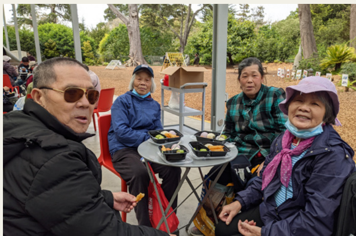
The seniors enjoyed an outdoor picnic after the museum visit.