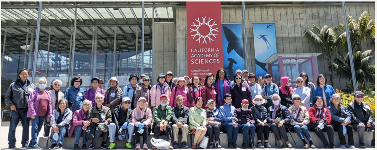
Mayor London N. Breed met and greeted the seniors at the California Academy of Sciences on May 27.