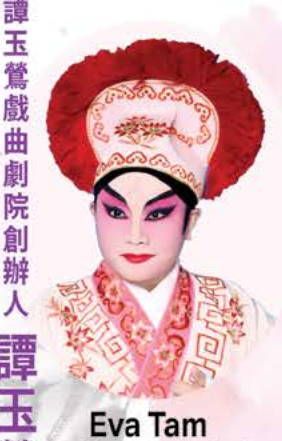
My Opera Institute Founder